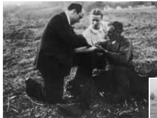
Dr. Robert Ritter and his associate Eva Justin taking a blood sample as part of their racial research on Gypsies. Landau, Germany, 1938.

Efforts to bring charges against Ritter and his associates as accessories in the deaths of the German Gypsies were discontinued. The trial of Dr. Robert Ritter ended with his suicide in 1950.