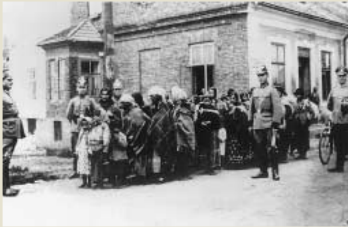
Prussian police escort Gypsies who are being deported to Auschwitz-Birkenau. Germany, 1943-1944.

of the state. Gypsy school-children who were truant were deemed delinquent and sent to special juvenile schools; those unable to speak German were deemed feeble-minded and sent to “special schools” for the mentally handicapped. Like Jewish children, Gypsy boys and girls also commonly endured the taunts and insults of their classmates, until March 1941 when the regime excluded Gypsies from the public schools.