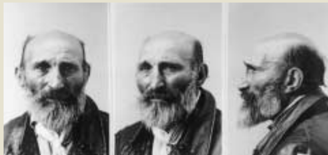
Bundesarchiv Koblenz, Germany.